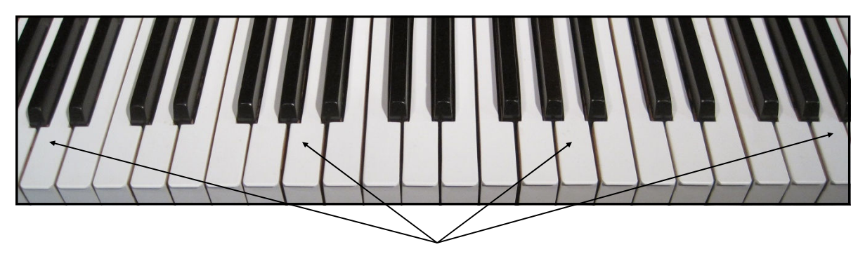
Octaves of 'A'

When a piano has been subjected to fluctuations of humidity, swelling or contraction of the soundboard will have resulted in the octaves from one end of the keyboard to the other of the piano not lining up well. This disparity in the octaves becomes obvious when both the left and the right hand are involved in the music. In such a situation, the piano will have an unbalanced, confusing sound.