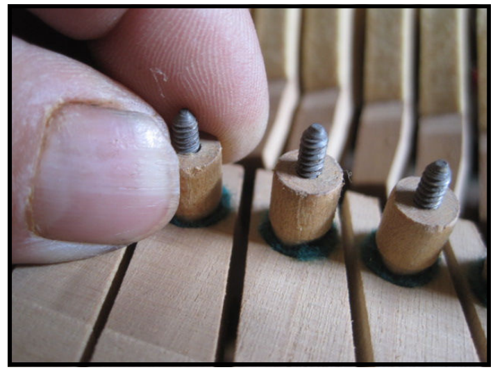
Adjusting lost motion with a fine touch.

At present, your piano is in need of adjustment as far as lost motion is concerned. Having the adjustment set correctly would improve the consistency of the touch of your instrument.