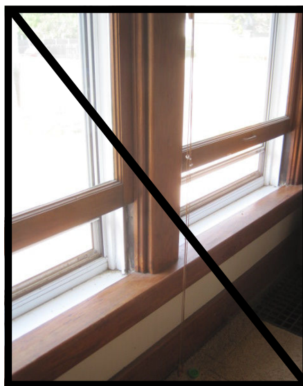
2. Drafty windows.

Note: Effective humidity control equipment, either for the home in general or the piano in particular, will aid in keeping your piano in top form.