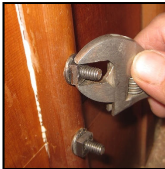
Toggle being tightened

One effective method of fixing the problem is to insert soundboard toggles to serve as clamps so that the ribs may be properly reglued to the soundboard. This repair may be accomplished on site, although more than one visit will be required to allow time for the process to be performed. The ribs of your piano are loose or separating from the soundboard and need to be repaired in order for the piano to sound its best.