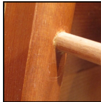
Dowel inserted in place.

In order to install toggles, 1/4" holes are drilled through the rib and soundboard at regular intervals from one end of the separation to the other. Woodworking glue is then worked into the space between the rib and the soundboard so that when the toggles are inserted and tightened down, the clamping action of the toggles produces a tight bond.