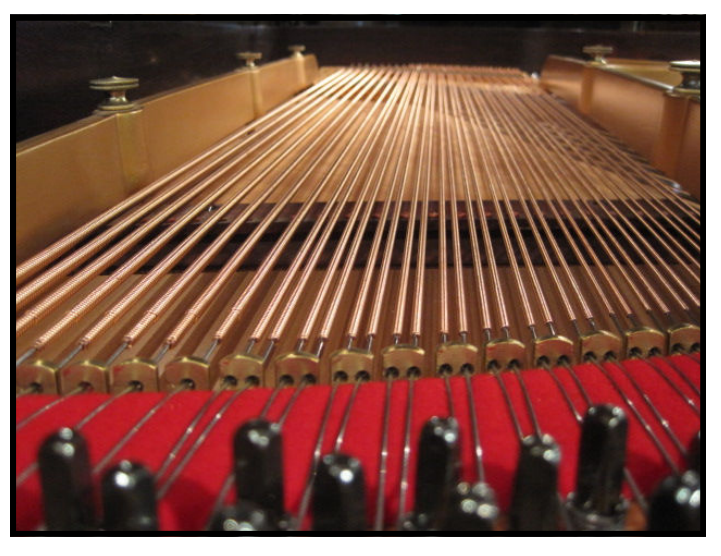
Newly installed bass strings in a 125-year-old Weber grand produce a rich bass sound once again.

Cause of loss of tone: As a piano ages, the bass strings gradually wear out. First of all the copper windings (photo above) which are wrapped on bass strings during manufacture lose some of their tension over the lifetime of the piano, making the strings less vibrant. Also the crevices between the windings of the strings tend to become clogged with microscopic dust particles which resist vacuuming or even blowing out with compressed air.