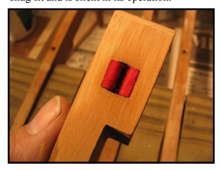
A key which has been professionally rebushed.

Functionality of the Parts: The wooden portion of the key (the "keystick") operates much as a child's teeter-totter. The center of each key rests on the balance rail, which serves as the fulcrum. Two polished "keypins" (front rail pin and balance rail pin) keep the key tracking in a straight line. Felt punchings (the green and white felts in the photos above) cushion the keys from underneath, and felt bushings (the red felts in both photos) help to make sure that each key has a snug fit and is silent in its operation.