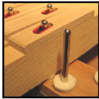
Front rail bushings