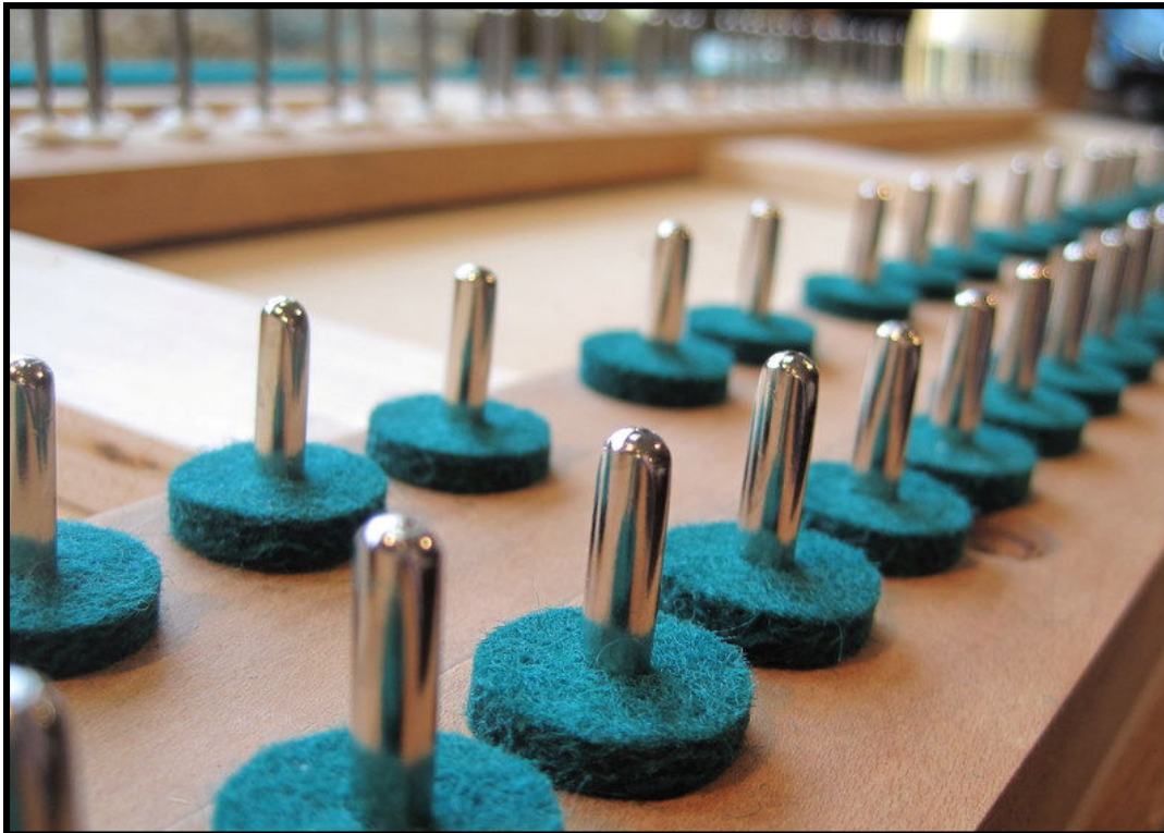
New set of keyed felts in place.

"In business to bring your piano to its full potential."