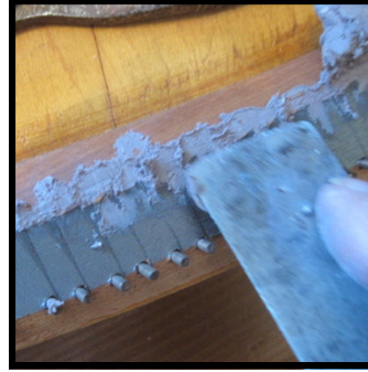
Split-out holes are filled.

Fortunately, when the splitting is not too severe, an on-the-spot remedy is often possible by the use of a heavy paste epoxy to fill in the damaged area. Oftentimes, if enough time is allowed for, this repair may be made on the same day that the piano is tuned. The bass bridge pins of your piano are loose to the point where it is affecting the tone of the piano. To make epoxy repairs to the bass bridge of your piano, extra time will need to be scheduled ahead of your tuning appointment.