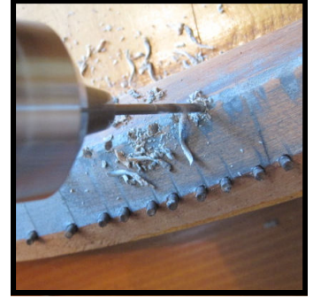
New holes are drilled.

With the bass strings temporarily removed from the bridge and bundled out of the way, the loose bridge pins will be pulled out completely so that the epoxy filler may be used. This epoxy cures rapidly as a result of the chemical reaction to the two components that are mixed together on the spot. Within a short amount of time, the hardened epoxy is ready to sand and drill for the reinsertion of the bridge pins.