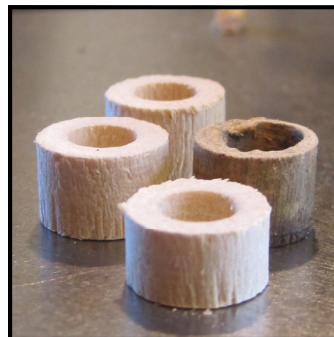
New and old bushings.

The tuning pin bushings of your piano are definitely worn and could stand to be replaced. The ideal time for installing a new set of bushing would of course be when the job of repinning and restringing are done. If the bushings are not replaced and later turn out to provide inadequate support for the tuning pins, it will be too late to make the change.