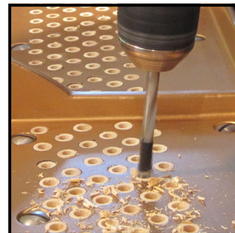
Reaming for tuning pins.

In order to install new tuning pin bushings, the old bushings must first be carefully removed from the cast iron plate. With the old pins, strings and bushings out of the way, the plate may be cleaned up in preparation for the installation of the new parts..