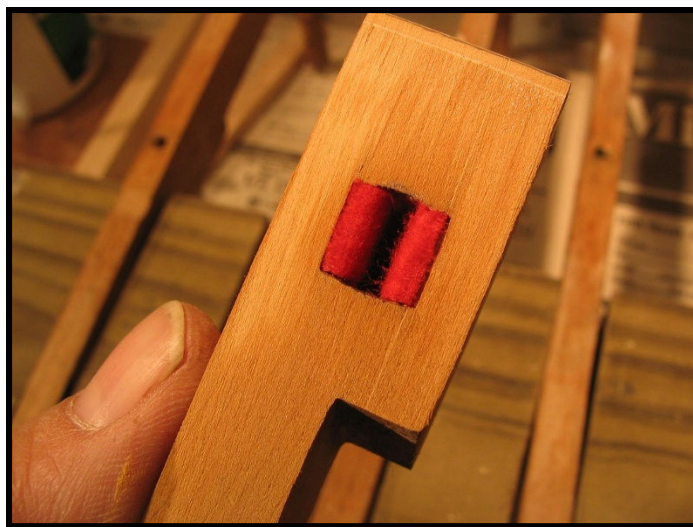
A key which has been professionally rebushed.

Functionality of the Parts: The wooden portion of the key (the "keystick") operates much as a child's teeter-totter. The center of each key rests on the balance rail, which serves as the fulcrum. Two polished "keypins" (front rail pin and balance rail pin) keep the key tracking in a straight line. Felt punchings (the green and white felts in the photos above) cushion the keys from underneath, and felt bushings (the red felts in both photos) help to make sure that each key has a snug fit and is silent in its operation.