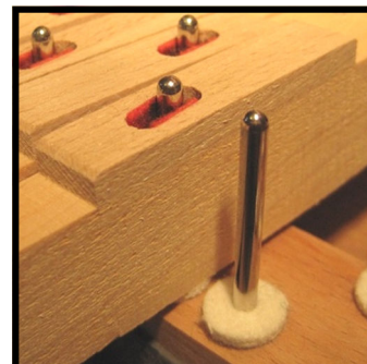
Balance rail bushings